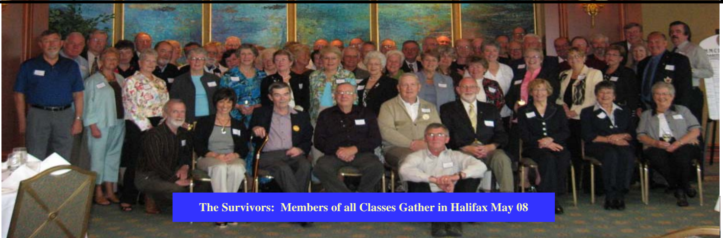
The Survivors: Members of all Classes Gather in Halifax May 08