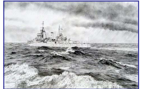
HMCS Ontario: A Bone in her Teeth; sketch by Don MacMillan (Class of '58)

KIT SHOP: For those who may have missed the announcement in previous Signals , the Venture Website ( www.hmcsventure.com ) provides a direct link to the "kit shop" where you may purchase Venture-crested and other items (e.g., generic RCN, NAVY, ship/squadrons insignia, etc) from two suppliers — feel free to place your orders (and special requests, e.g., for car decals) well in advance of the 2009 Halifax Reunion. The addresses are: